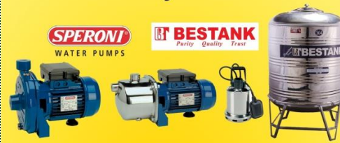
Water Pumps & Storage Tank