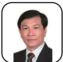
Ismael Tabije Club Service